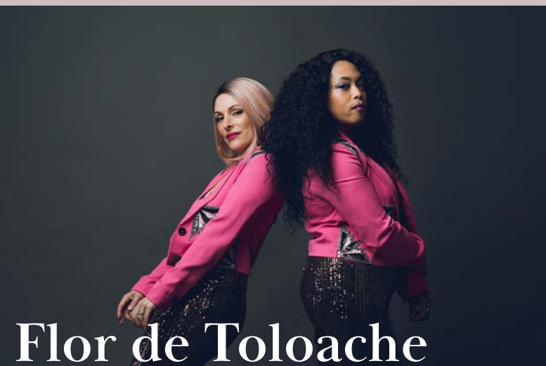
Flor de Toloache

In addition to the Featured Artist Program, the Swarthmore Music Program is thrilled to present worldclass musicians in a range of masterclasses, lectures, and performances.