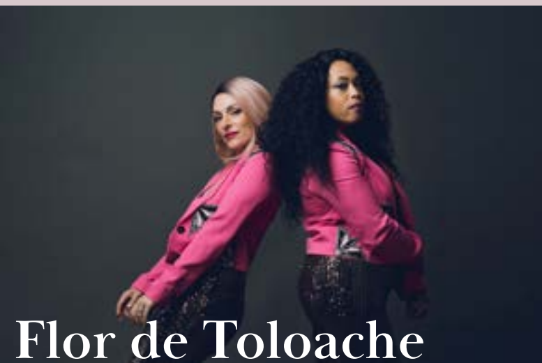
Flor de Toloache

In addition to the Featured Artist Program, the Swarthmore Music Program is thrilled to present worldclass musicians in a range of masterclasses, lectures, and performances.