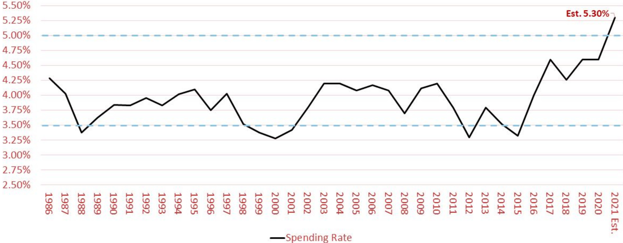
Spending Rate By Fiscal Year