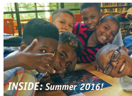
INSIDE: Summer 2016!