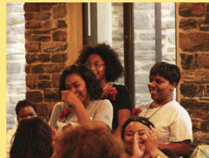
11 HIGH-SCHOOL SENIORS were honored at a special dinner, as part of the spring concerts. Guests enjoyed a delicious buffet at Sharples dining hall and were given seniors gifts of bracelet charms and engraved dog tags, as well as corsages.