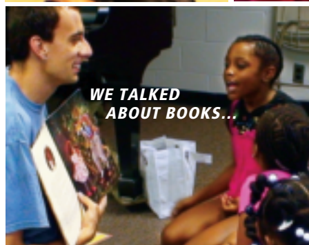
WE TALKED ABOUT BOOKS...