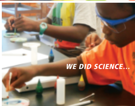
WE DID SCIENCE...

... AND WE CAN'T WAIT TO DO IT ALL AGAIN!