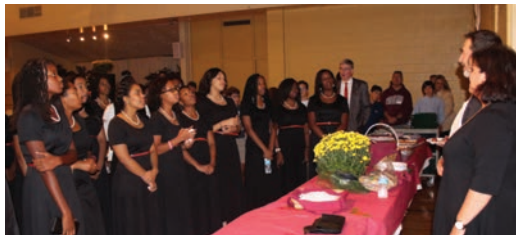
Singing for St. Luke in appreciation of their support.

For anyone thinking of hosting a concert or other event, such as a dinner, just DO IT!