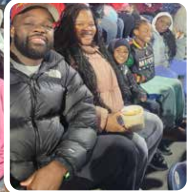
CCC families enjoyed a night at the ballpark, courtesy of the Philadelphia Phillies Charities.