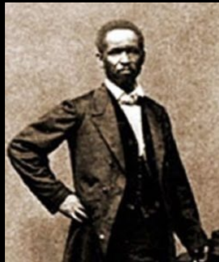
Shadrach Minkins 1814-1874