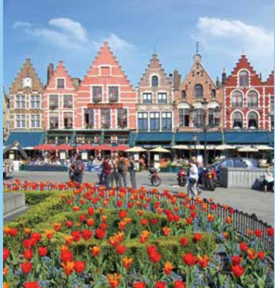
The lively, medieval Market Square is the principal city square and gathering point in Bruges.