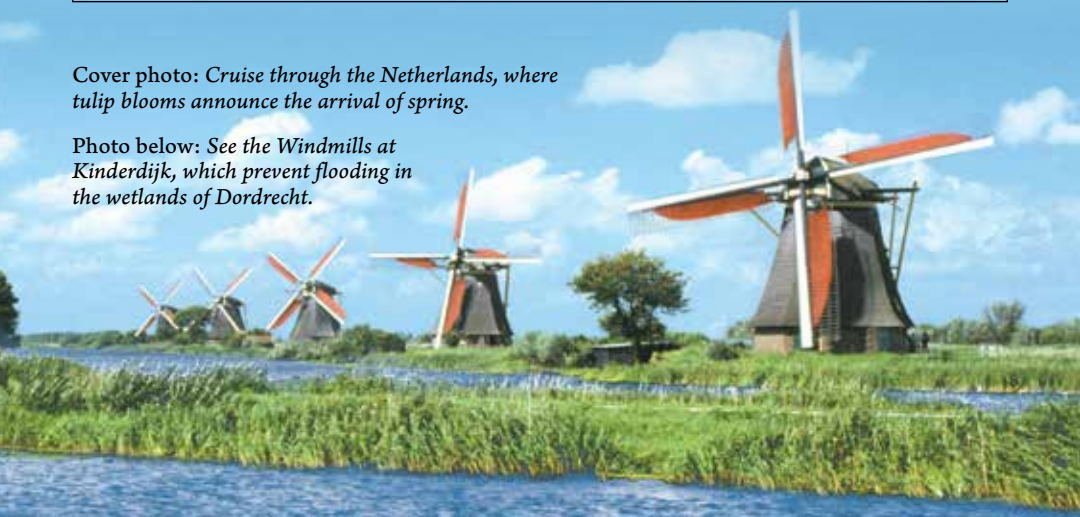
Photo below: See the Windmills at Kinderdijk, which prevent flooding in the wetlands of Dordrecht.

Cover photo: Cruise through the Netherlands, where tulip blooms announce the arrival of spring.