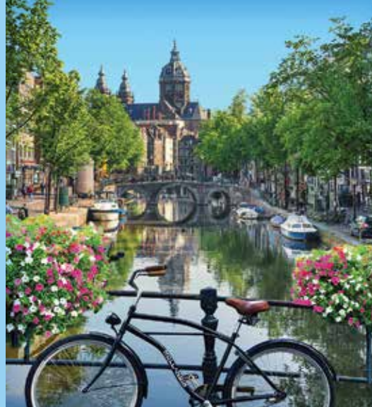
Amsterdam's bridges and canals bring the intimacy of a small town to one of Europe's most celebrated cities.