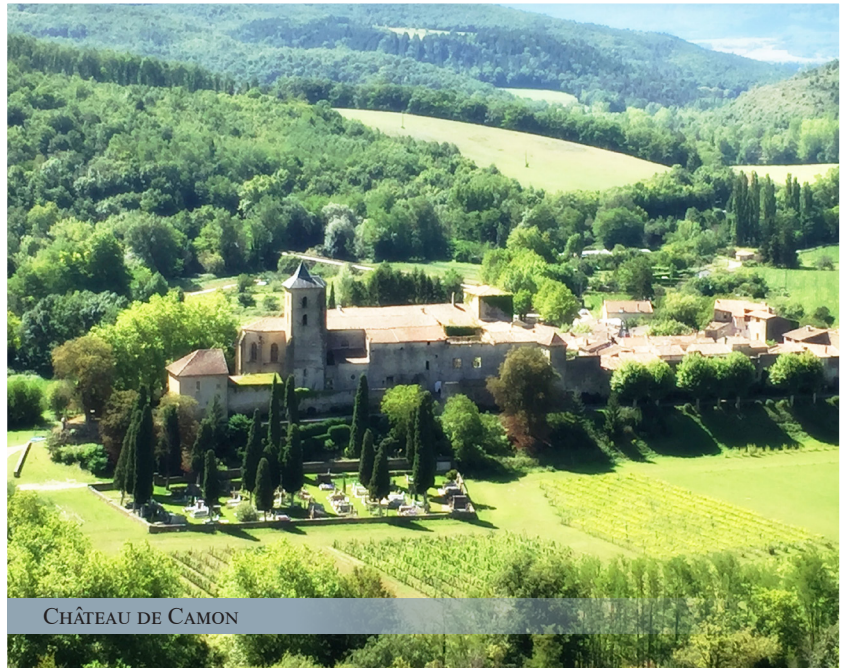
CHÂTEAU DE CAMON