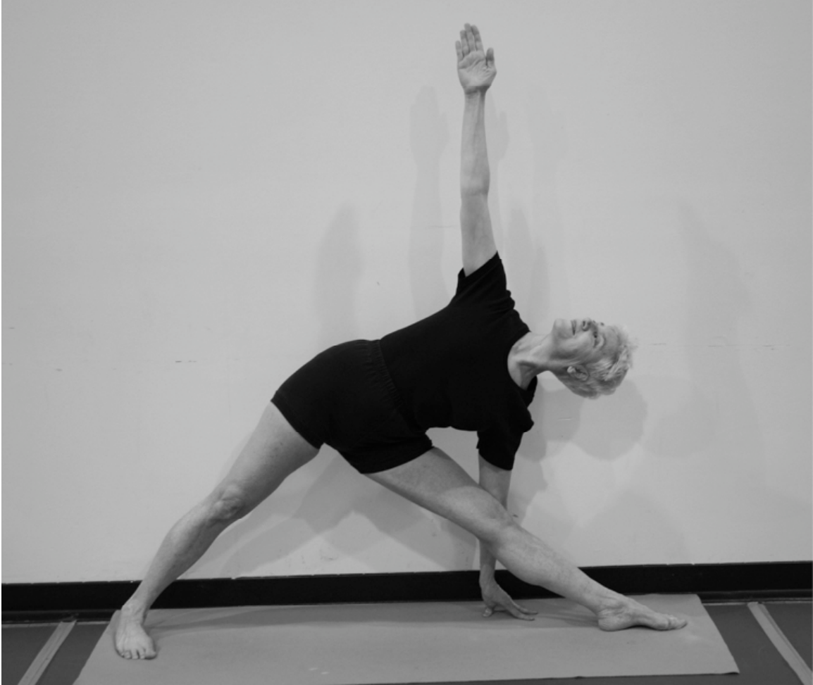
Fig. 3. Utthita Trikonasana (Triangle Pose).

We have been investigating the physical and mental activity involved in producing a particular shape, but we must not ignore finer layers of poses. In Patanjali's system, asana is the third of eight branches of practice, immediately following rules for ethical behavior ( yama, niyama ), and preceding breath restraint ( pranayama ), sense withdrawal ( pratyahara ), concentration, meditation and bliss ( dharana, dhyana, samadhi ). However, according to Iyengar, samadhi can be attained at any moment: "Perfection in an asana is achieved when the effort to perform it becomes effortless and the infinite being within is reached" [19].