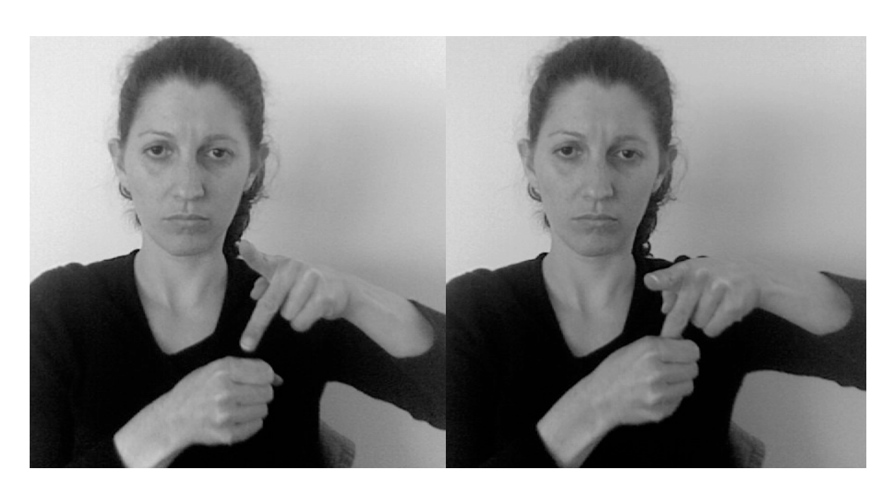
Illustration 9: insulting name sign for PHILADELPHIA