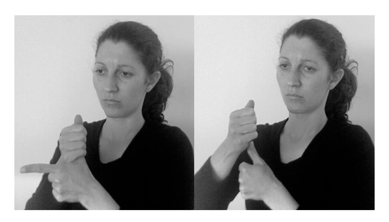
Illustration 7: (insulting) name sign for LOUISIANA