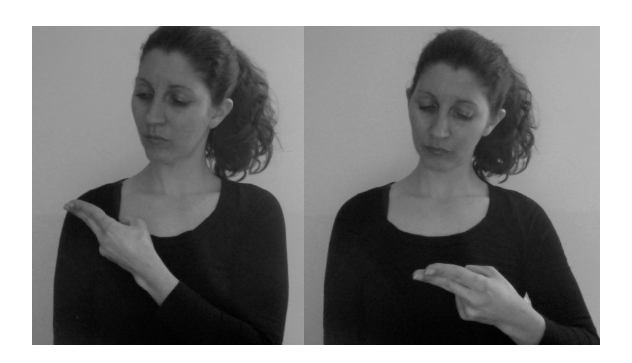
Illustration 1. one variant of HELL