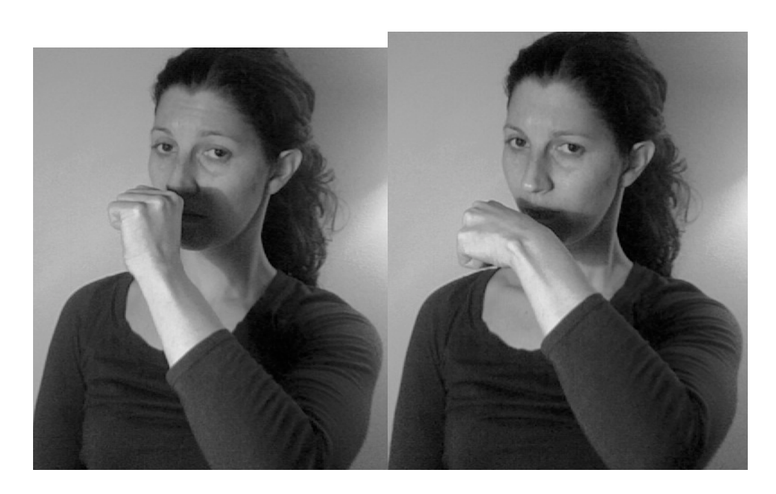
Illustration 4: variant of SHIT made at the nose