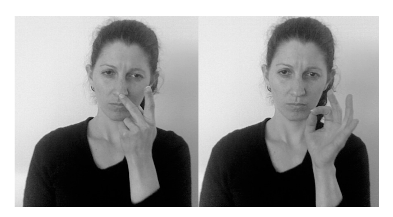
Illustration 5. PISS-OFF