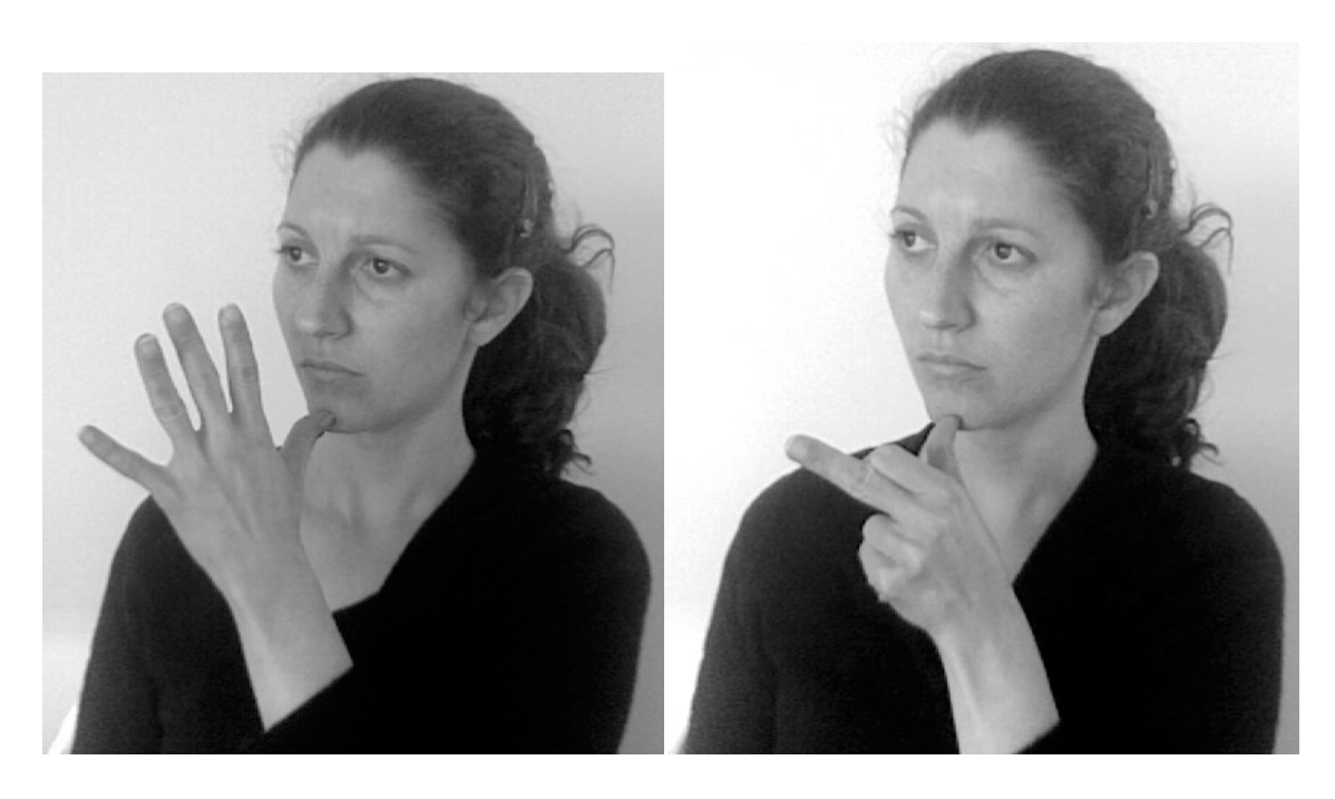
Illustration 8: MOTHER and MOTHERFUCKER