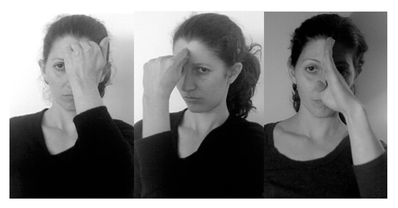
Illustration 6: insulting name sign for Alexander Graham Bell