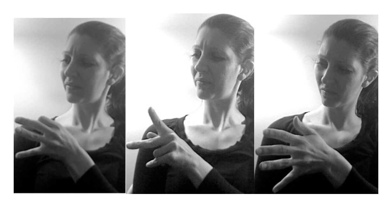
Illustration 13: F-K FINISH