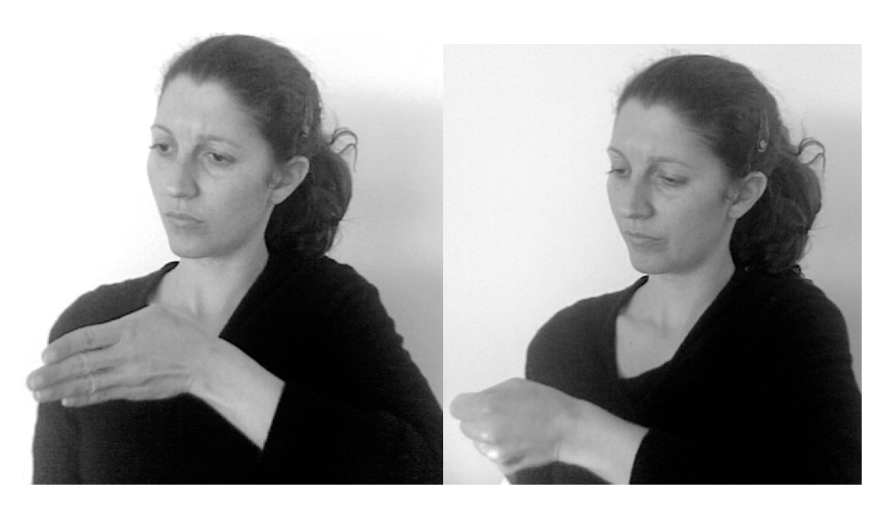
Illustration 2: one variant of BULLSHIT