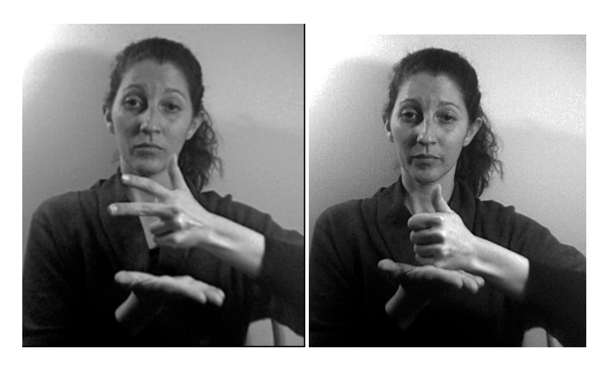
Illustration 11: another variant of FUCK-UP