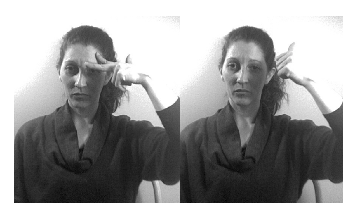
Illustration 12: one variant of FUCK-UP-IN-THE-HEAD