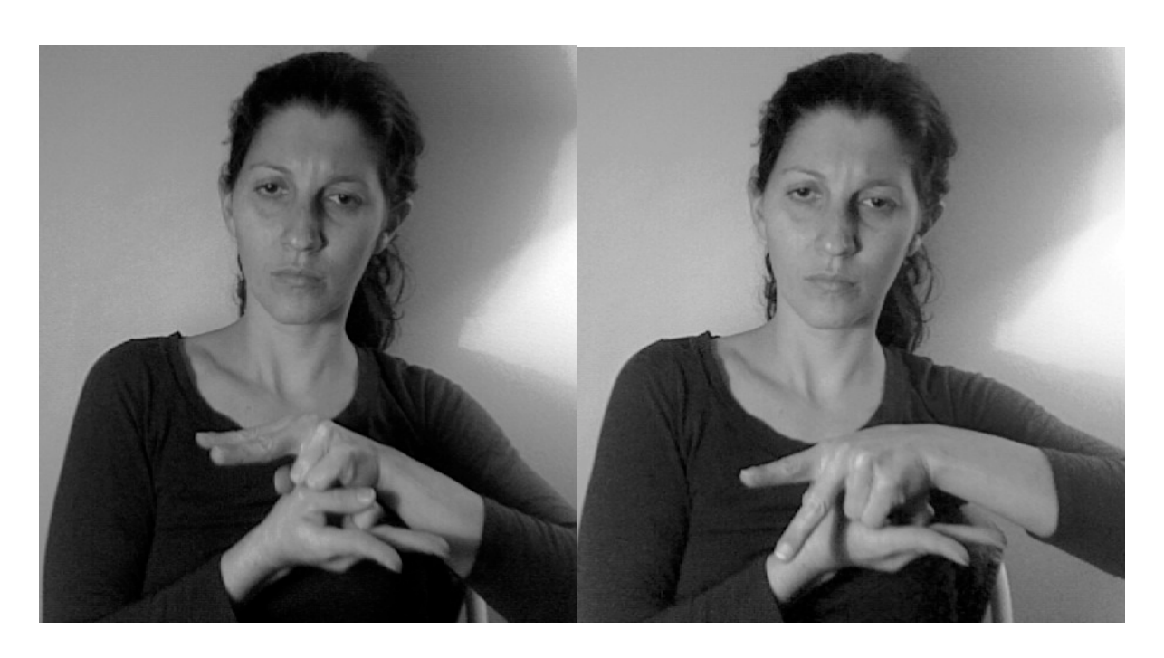
Illustration 10: one variant of FUCK-UP